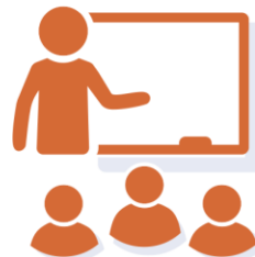
14-week coding Bootcamps