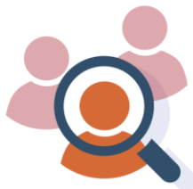
Strict selection process