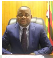
Hon. Prof. Paul Mavima Minister of Primary and Secondary Education, Zimbabwe

Bio Link | https://millenniumedu.org/bios/professor-sarah-mbi-enow-anyang-agbor/