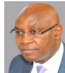
Mr Serigne Mbaye Thiam Minister of National Education, Senegal

Bio Link | https://millenniumedu.org/bios/paul-mavima/